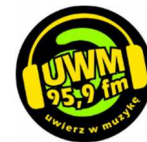
Radio UWM FM media patronage