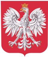
The Voivod of Warmia and Mazury Artur Chojecki