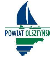
County Office in Olsztyn